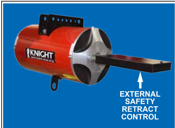
Figure 5-3 Balancer With Retract Control