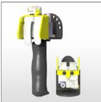
Two (2) Button Model# EPPA9450 (Shown)