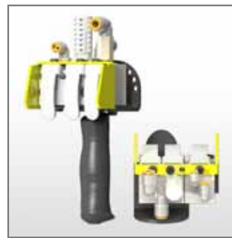
Three (3) Button Model# BPA9430 (Shown)