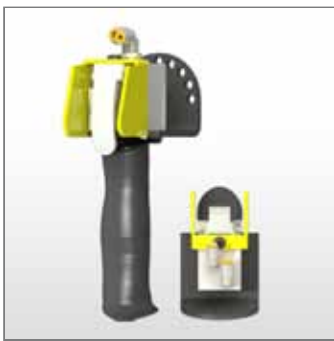
One (1) Button Model# BPA9400 (Shown)