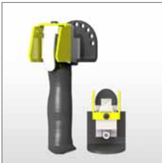
One (1) Button Model# EPA9500 (Shown)