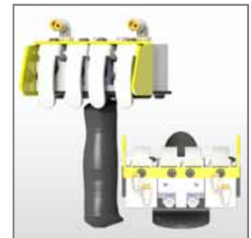
Four (4) Button Model# EPPA9464 (Shown)