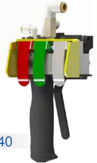
EPPTA9340 Rear Trigger Lever

Levers can be customized with stamped callouts for identification and ease of use. Callouts are available in different languages. Angled levers are used for optimum ergonomics. Up (Green) and Down (Red) levers are standard colors. Custom colors can be applied according to customer specification. Control Handle Trigger levers can be mounted on the back of the handle for optimum ergonomics or as a fifth button.