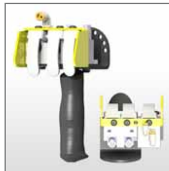
Three (3) Button Model# EPPA9460 (Shown)