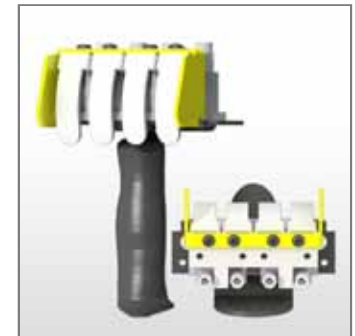
Four (4) Button Model# EPA9660 (Shown)