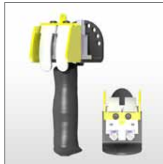
Two (2) Button Model# EPA9600 (Shown)