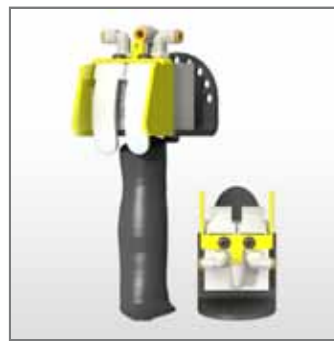
Two (2) Button Model# BPA9100 (Shown)