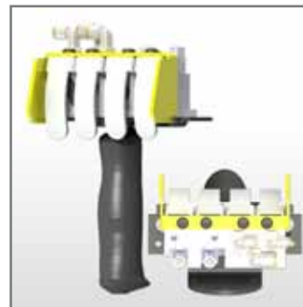
Four (4) Button Model# EPPA9160 (Shown)