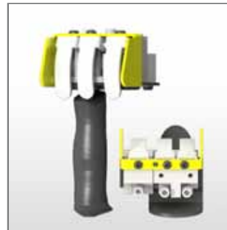
Three (3) Button Model# EPA9650 (Shown)